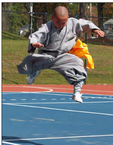
Following the ceremony in which the Abbot received an honorary doctorate, His Excellency's disciples gave a demonstration of Shaolin Kung-Fu. At only 10 years old, the young monk pictured was capable of extraordinary feats of physical skill. His performance charmed area residents attending the event.

"I would like to thank this great institution, the United States Sports Academy, for awarding me this Honorary Doctorate degree, which is not only an honor for me but also an honor for the Shaolin Temple," the Abbot said in his native language during his acceptance speech. "I believe the most important part of this award is that it promotes the Shaolin culture, and more broadly, a two-way dialogue between Chinese and American cultures."