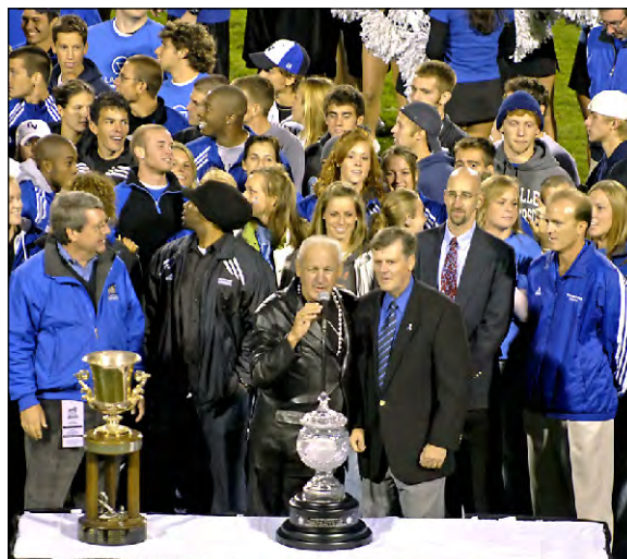
Grand Valley State University Division II