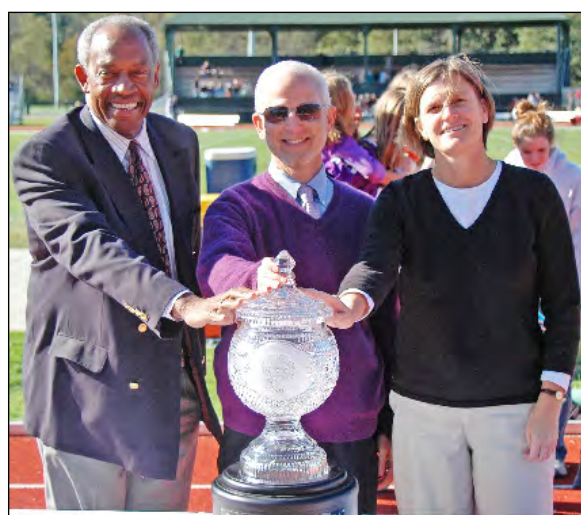
Williams College Division III