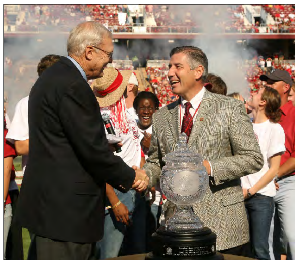
Stanford University Division I

The U.S. Sports Academy Directors' Cup is presented annually, in cooperation with the National Association of Collegiate Directors of Athletics (NACDA) and USA Today , to the best overall men's and women's collegiate athletic programs in North America.