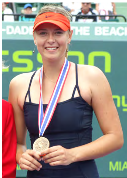
Russian tennis sensation Maria Sharapova was named the Academy's Female Athlete of the Year after winning the U.S. Open and posting a 59-9 match record in 2006.

The Academy's Awards of Sport program pays tribute to individuals who have made significant contributions to sport through a commitment to academic, administrative, artistic or athletic endeavors for the advancement of the sports industry. With the theme of the artist and the athlete in mind, the Academy annually recognizes these men and women through its Athlete of the Year competition, Medallion Series Awards and Distinguished Service Awards.