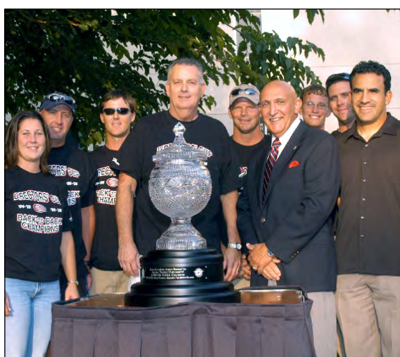
Azusa Pacific University NAIA