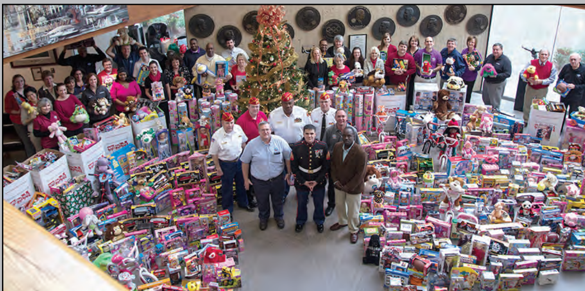
The 2013 Toys for Tots campaign resulted in the largest collection that the Academy has had in its 18 years with the program. The collection was made possible by the coordinated efforts of Academy staff and the Jesse Andrews Jr. Marine Corps League Detachment in Daphne, Ala.