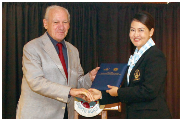
The Academy in conjunction with the Sports Authority of Thailand (SAT) has run sports certification programs for the last nine years.

This year included among other things in-depth looks at the United States Olympic Committee's (USOC) Training Center in San Diego, and the United States Tennis Association's (USTA) Billie Jean King National Tennis Center in Flushing, N.Y.