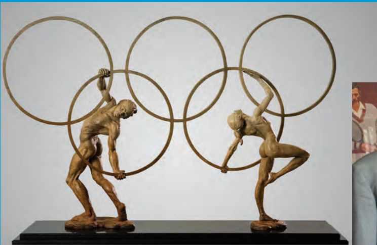
The sculpture, "Olympic Spirit," by Edward Eyth, the 2013 Sport Artist of the Year, depicts a male and female athlete elevating the five rings that symbolize the Olympics. A similar large outdoor sculpture received the Olympic Rings Award and was selected for inclusion in the 2008 Beijing Olympic Landscape Sculpture Design Exhibition.