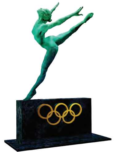
"Balance" by Edward Eyth

The museum holds arguably the largest collection of sport art in the world and is open free to the public weekdays. For more information, visit the ASAMA website at www.asama.org .