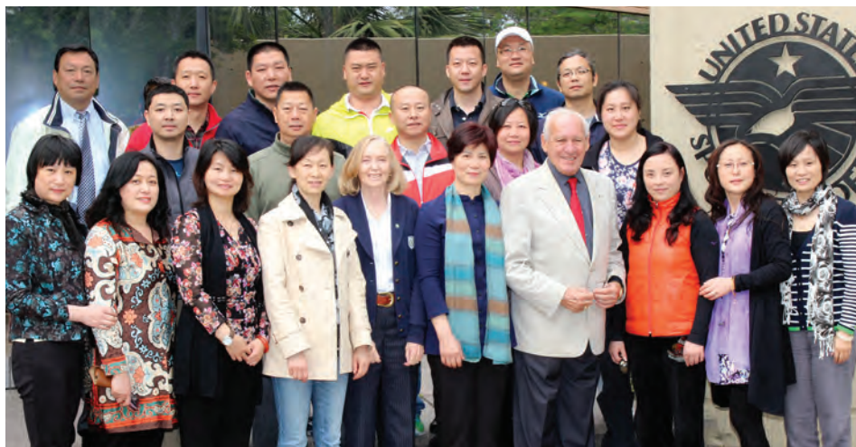
The Shanghai Administration of Sports has called on the Academy to train its elite athletes in coaching.

While on campus, the Chinese students participated in seminars taught by Academy faculty on subjects, such as coaching methodology, sports psychology, strength and conditioning, fitness and sports medicine.