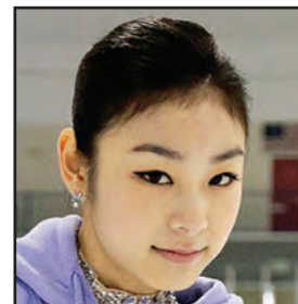
Yuna Kim 2013 Athlete of the Year