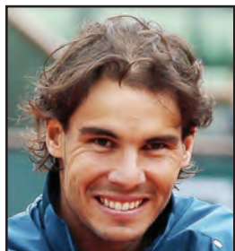
Rafael Nadal 2013 Athlete of the Year